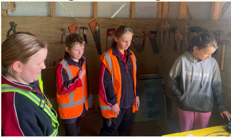
Visiting Hedgehope School workshop where projects are designed & built