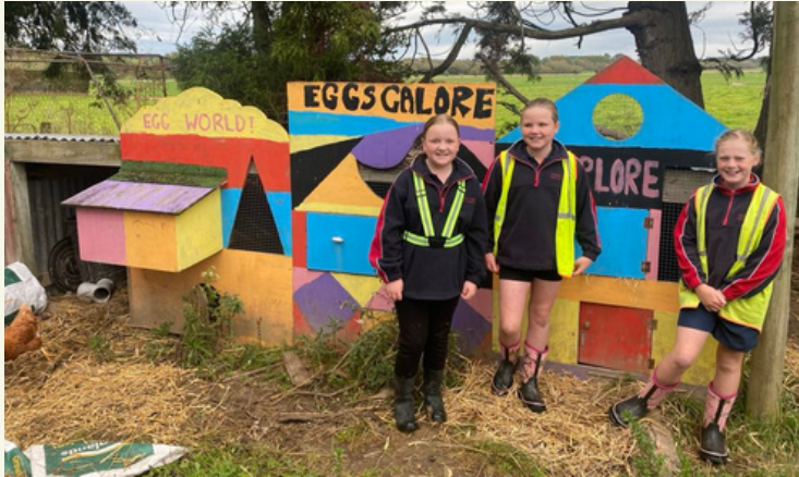
Learning about raising chickens

On 28th March, Woodlands Kaitiaki leaders were invited to attend an Environmental Hui at Hedgehope School. The children learnt about some environmental projects that the students at Hedgehope had created and then visited Sherwood Forest.