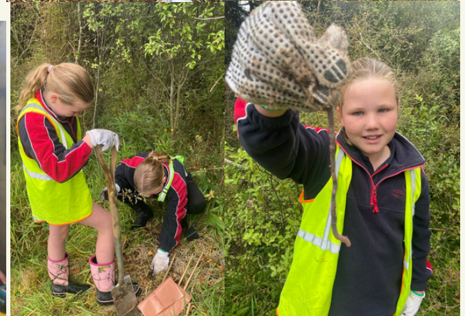
Planting native trees at Sherwood Forest